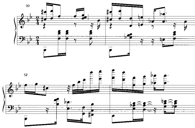
FIG. 7. Measures 50–53 can include three ideas presented by the Gershwin variation of Fig. 6. A composer could similarly develop other parts of the variation to create a composed variation.

porary work. The originating vision for the technique was to use it in tandem with a piece that was considered finished—a piece that made a statement and, hopefully, a compelling one. The composer could then go on a journey with the musical score, in that the variation technique might take the artist elsewhere, to some place new or unimagined.