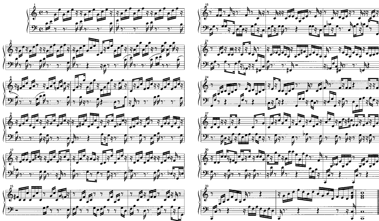
FIG. 3. The pitch sequence of Variation 3, with durations omitted. The mapping was applied to all N=545 pitch and chord events of the Prelude, with trajectories having reference IC (1,1,1) and new IC (1, 0.9999, 0.9). The Runge–Kutta solutions for both trajectories encircle the attractor’s right lobe once. The simulations advance 545 time steps with h=0.001 , and are sampled every step. All computations are double precision, with x -values rounded to six decimal places before the mapping is applied. The chaotic mapping fostered tracking in x for 41 out of 545 x -values, resulting in 41 pitch events appearing in the variation exactly where they occurred in the original.

note in the replaced chord. However, if any dynamic level occurs in the variation that is not desirable, the musician can adjust accordingly. Otherwise, the tempo, rhythm, and dynamic levels heard in the variation are the same as the original.