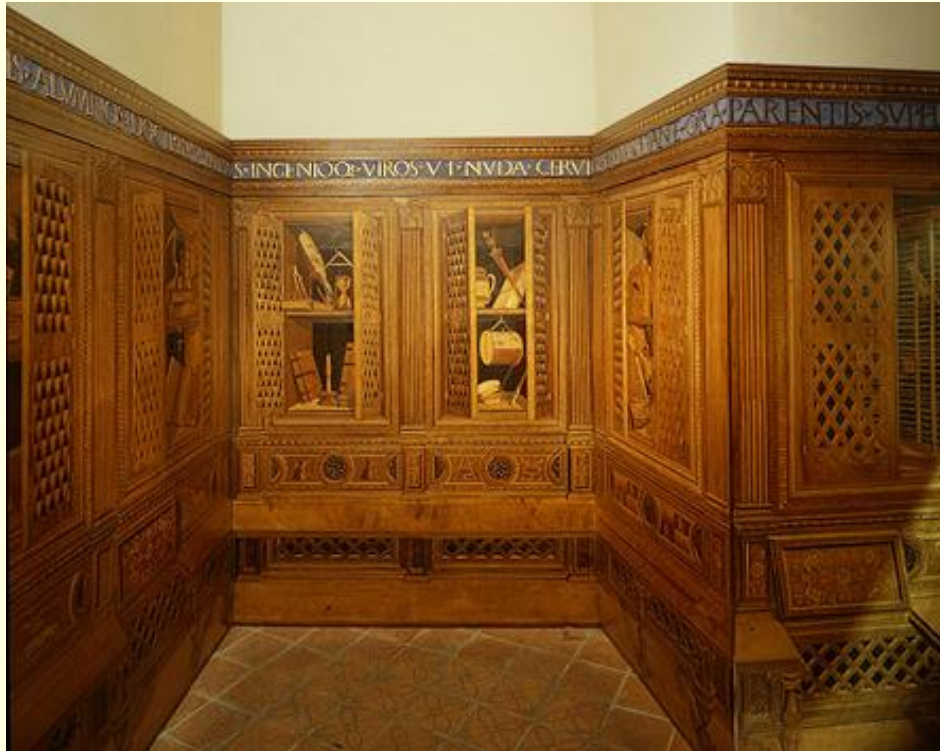
Studiolo from the Ducal Palace in Gubbio